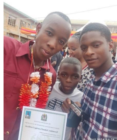
Dotto graduated from Form 4 of Secondary School!