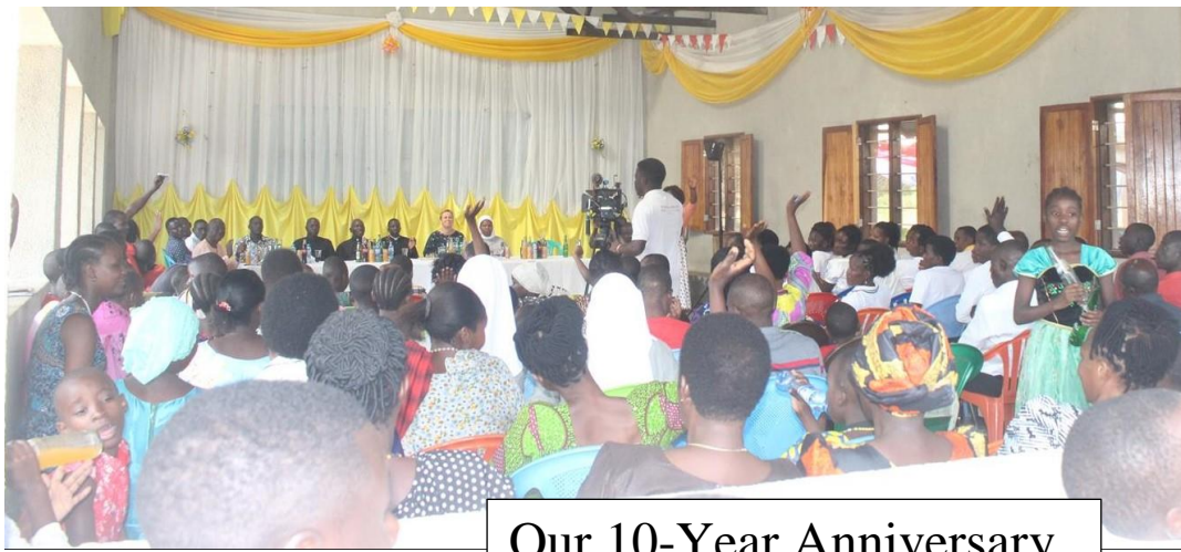
Our 10-Year Anniversary