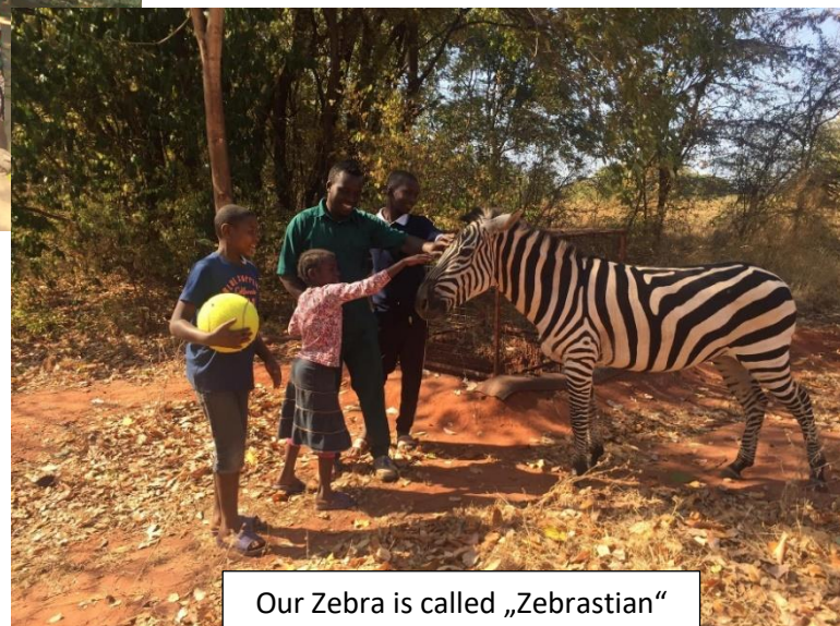
Our Zebra is called „Zebastian“

The kids always enjoy to travel and to do fun activities in smaller groups.