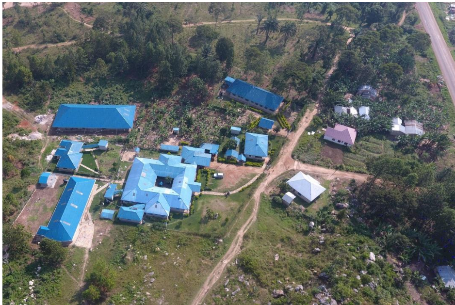
View over St. Nicholas