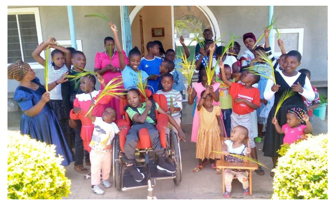
"Now that I, your Lord and Teacher, have washed your feet, you also should wash one another's feet!"